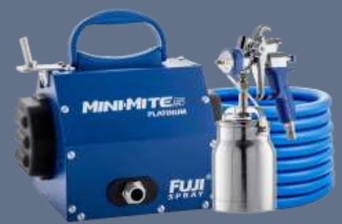
Mini-Mite 5 Platinum Turbine with T-Series Spray Gun