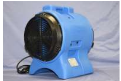
HALCON CYCLONE ULTRA 12" EXHAUSTER

Accessories kits are available for both exhausters, including: (1) 32.8foot intake hose, (1) 32.8-foot exhaust hose, (2) connecting straps, (1) duct coupler.