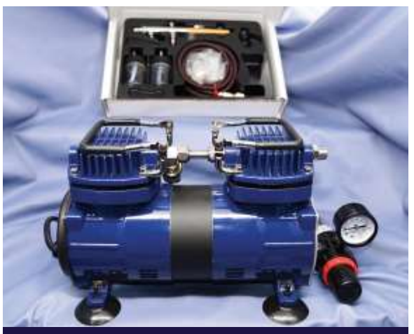
HALCON<sup>™</sup> STORM AIRBRUSH & COMPRESSOR BUNDLE

The Halcon Storm Airbrush Spray System, manufactured by industryleader Paasche, has been configured to Hawk's specifications, delivering the power and precision required for small resurfacing projects and surface repairs, in a compact and lightweight format.