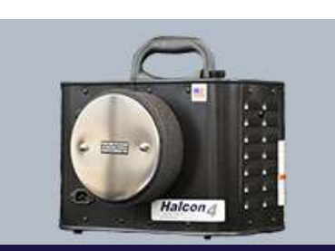
HALCON<sup>™</sup> 4 TURBINE