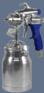
M-Series Spray Gun