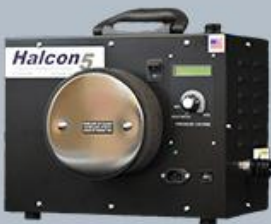
HALCON™ 5 TURBINE