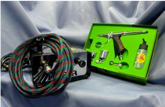
IWATA® NEO TRN2 AIRBRUSH WITH NINA JET COMPRESSOR & BRAIDED HOSE BUNDLE

This system is ideal for surface repair and resurfacing touch ups, and is a great option for everyone from beginner to pro-level airbrush skills.