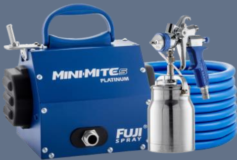
Mini-Mite 5 Platinum Turbine with T-Series Spray Gun