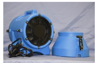
HALCON CYCLONE 8" EXHAUSTER