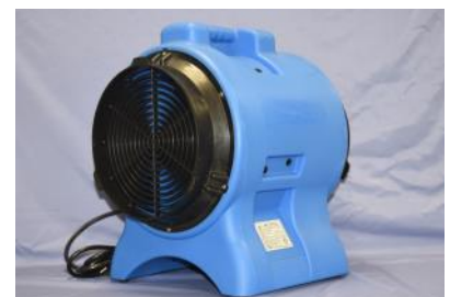
HALCON CYCLONE ULTRA 12" EXHAUSTER

Accessories kits are available for both exhausters, including: (1) 32.8-foot intake hose, (1) 32.8-foot exhaust hose, (2) connecting straps, (1) duct coupler.