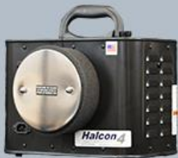
HALCON™ 4 TURBINE