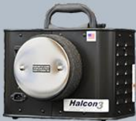
HALCON™ 3 TURBINE